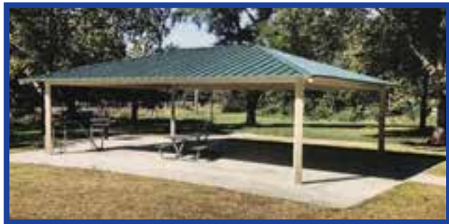
The new Belmont Living and Learning Center will be located in Belmont Park just north of the Belmont Community Center. The facility will be used to expand educational classes, physical activity, and provide a community meeting space.